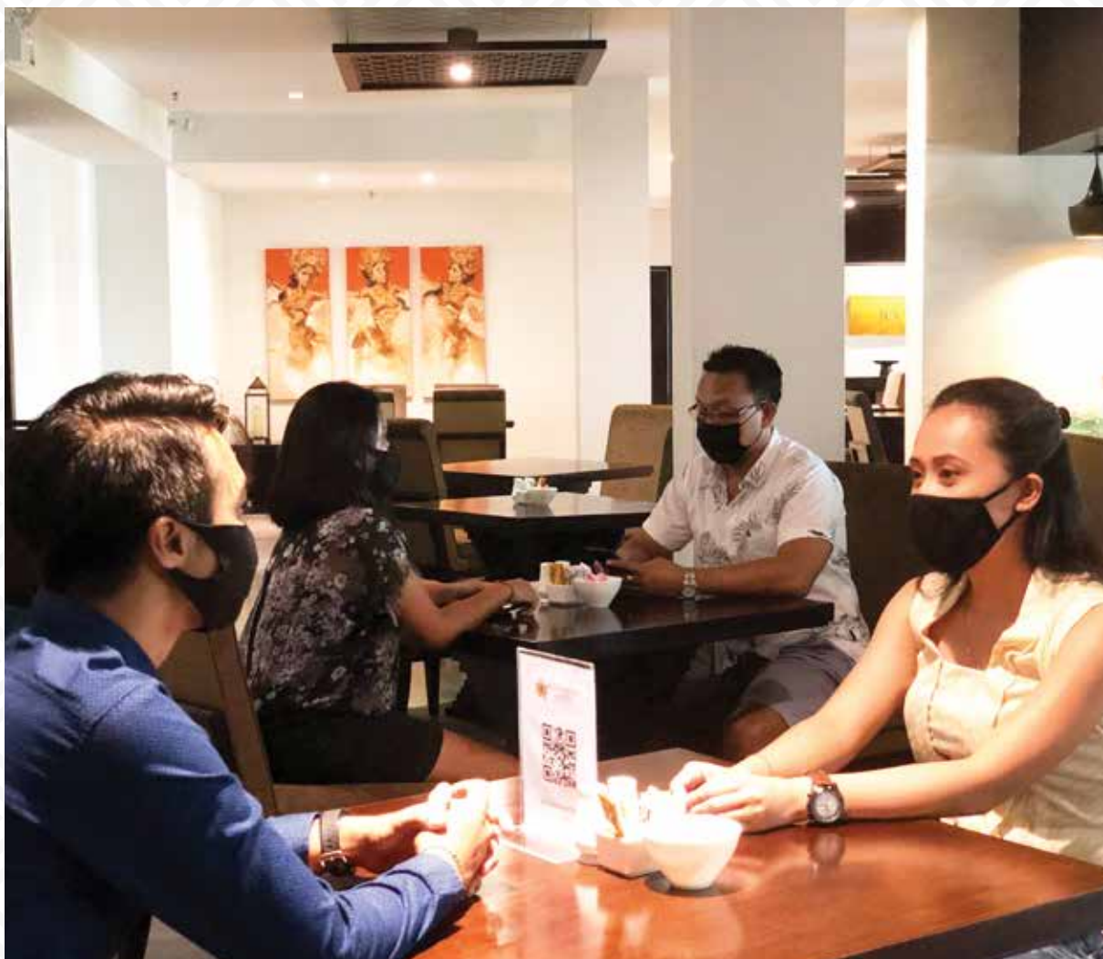
New seating arrangements with safe distance