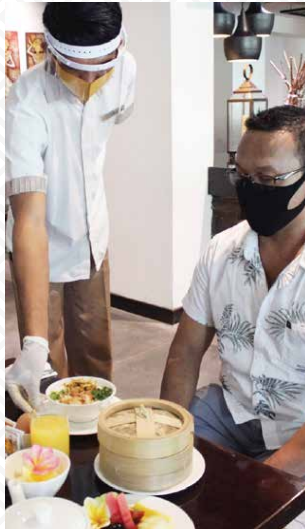
Enhanced food safety and hygiene standards