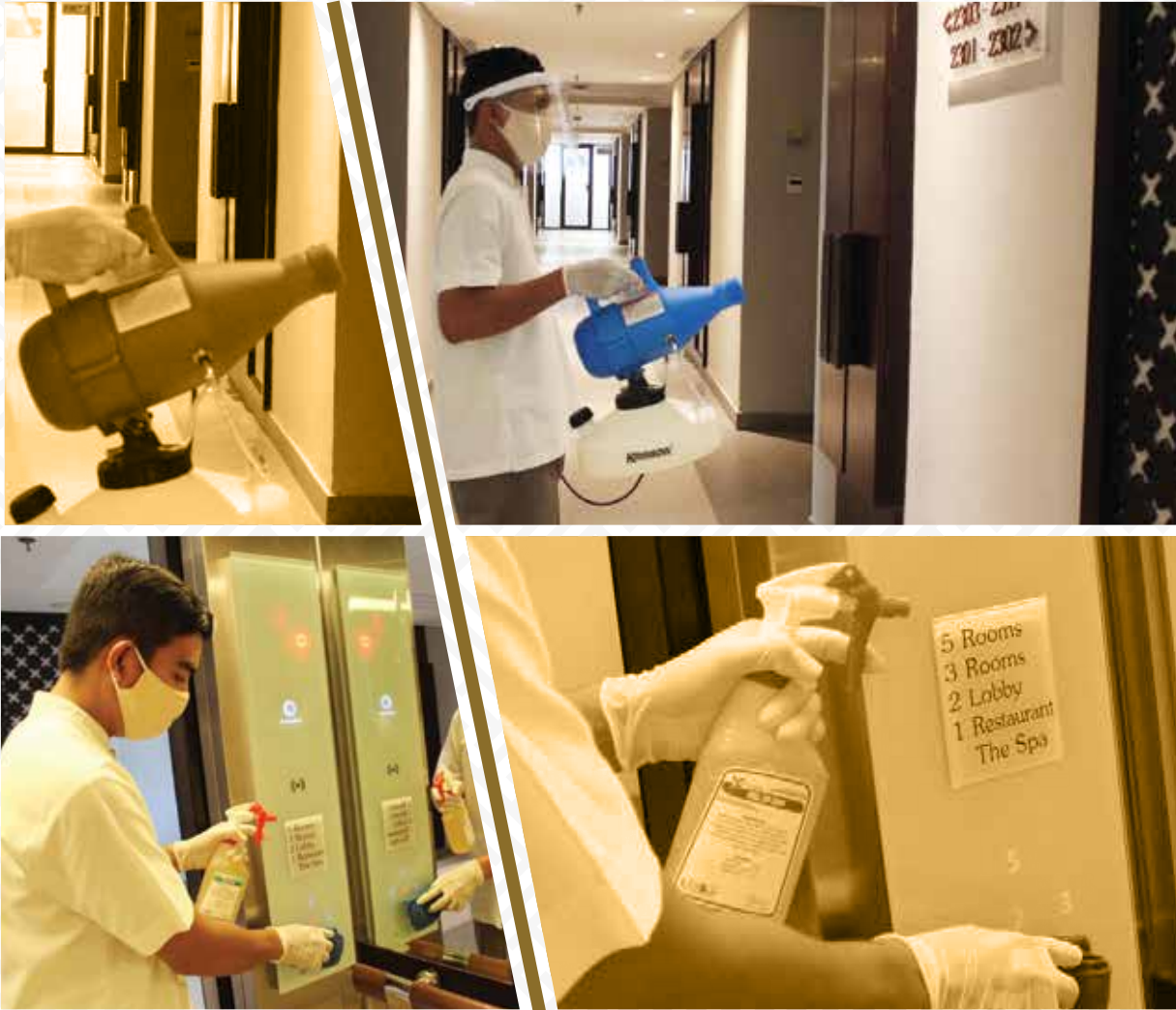
Enhanced cleaning program in public areas with frequent disinfection of high touch points areas