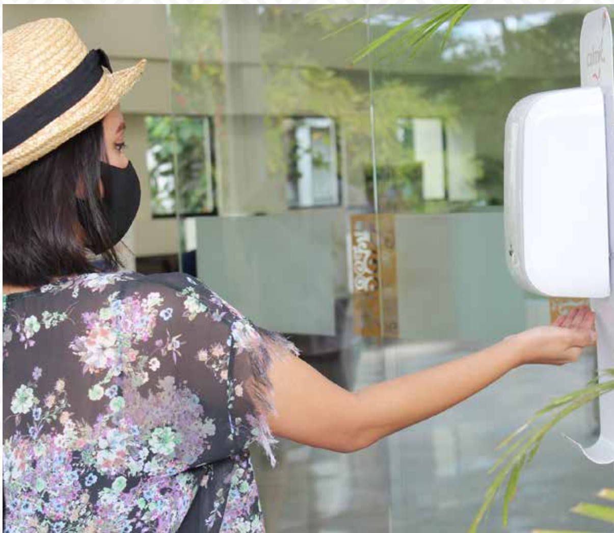
Hand sanitizer is provided in key public areas