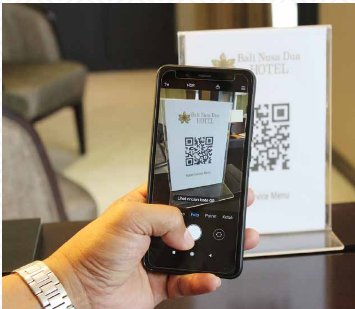
Contactless electronic payment QR codes menu for room service and restaurant