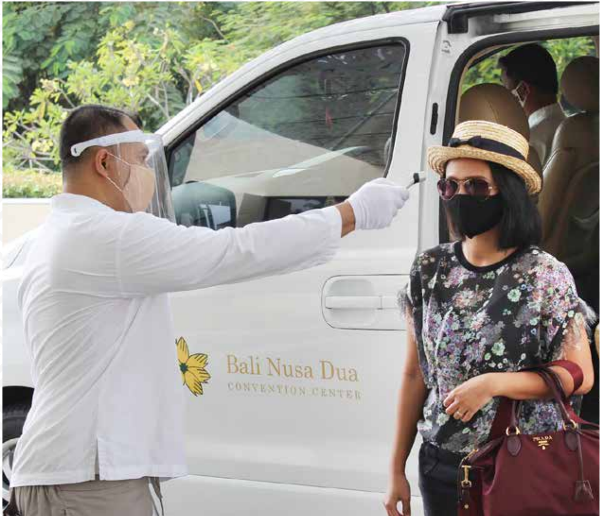
Temperature check upon arrival