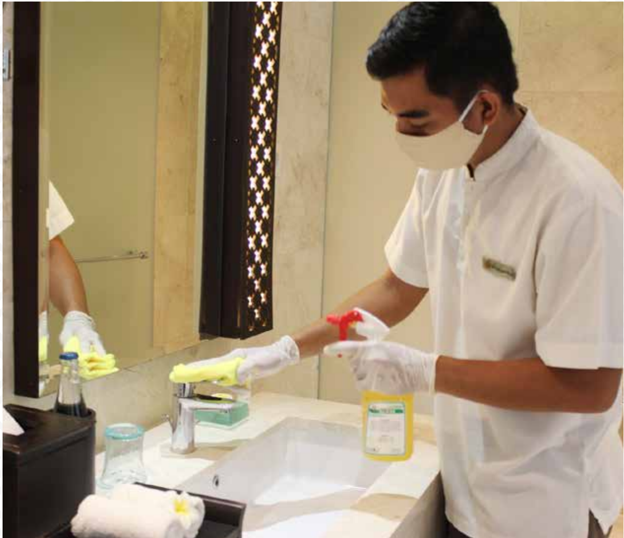
Reinforced room cleaning protocols