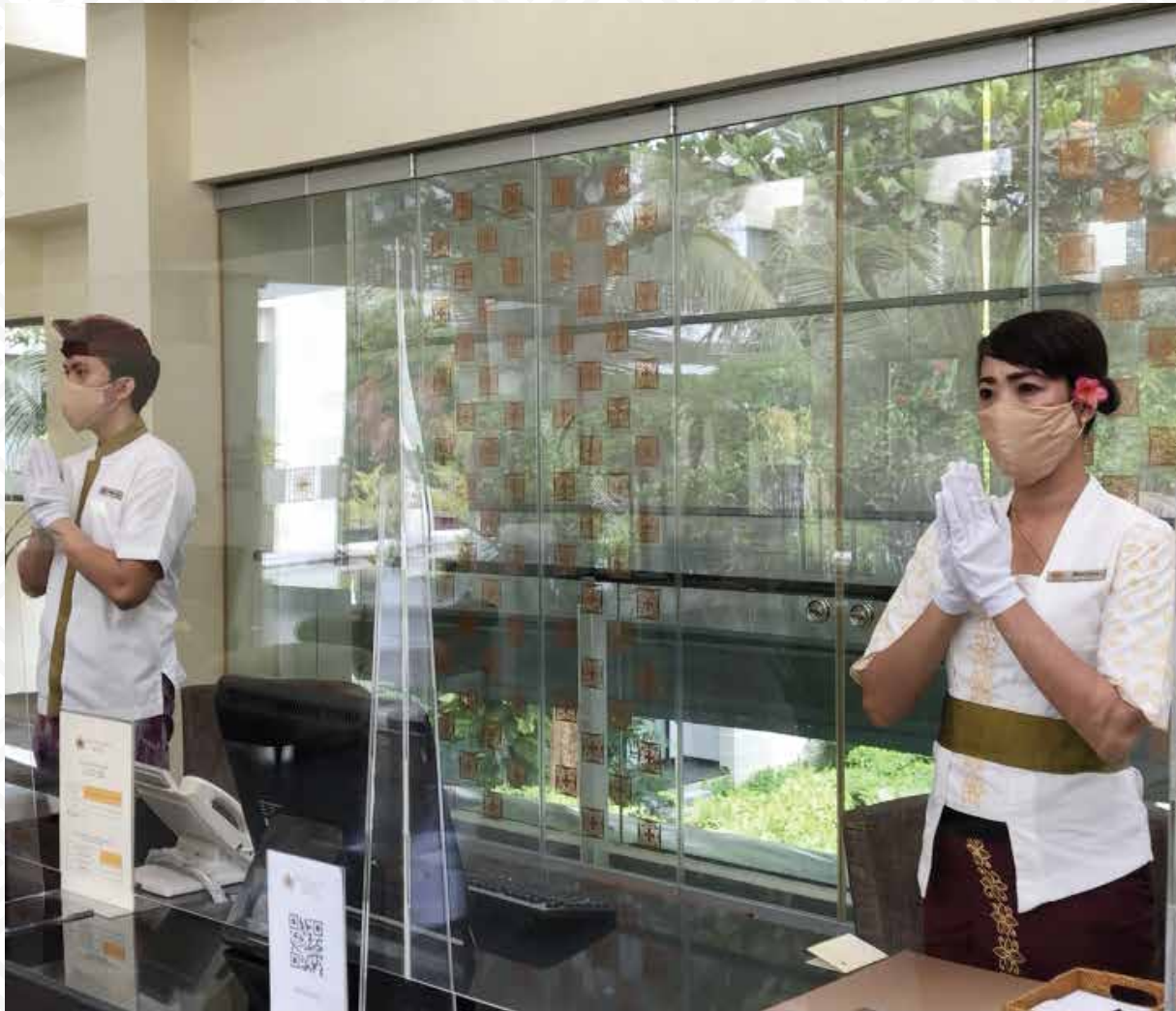
Comprehensive safety and hygiene training for employees